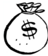
Proof of Funds

Our application process is simple. Our goal is to get to know you and your past real estate experience. Our paperwork is minimal & only required once per year. We have No Application or Credit Pulling Fees.